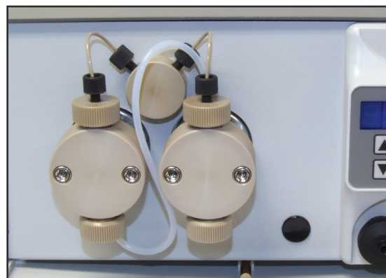
Several Fluid Path Materials Available